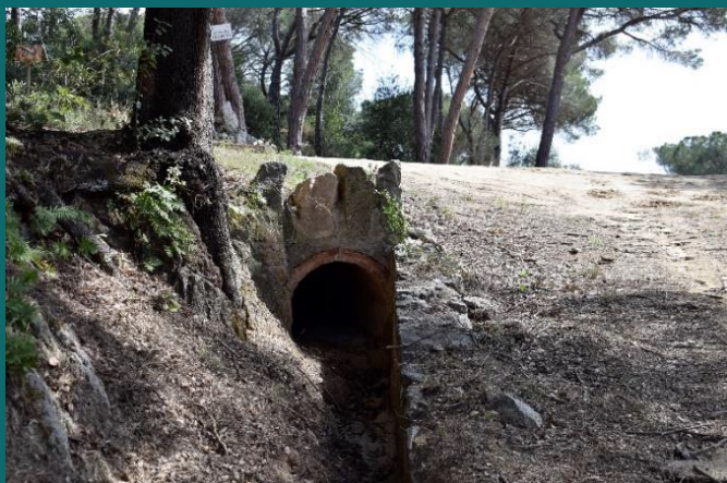
Figure 1. Channel for safer and more efficient water management, inside the Les Ginesteres property.