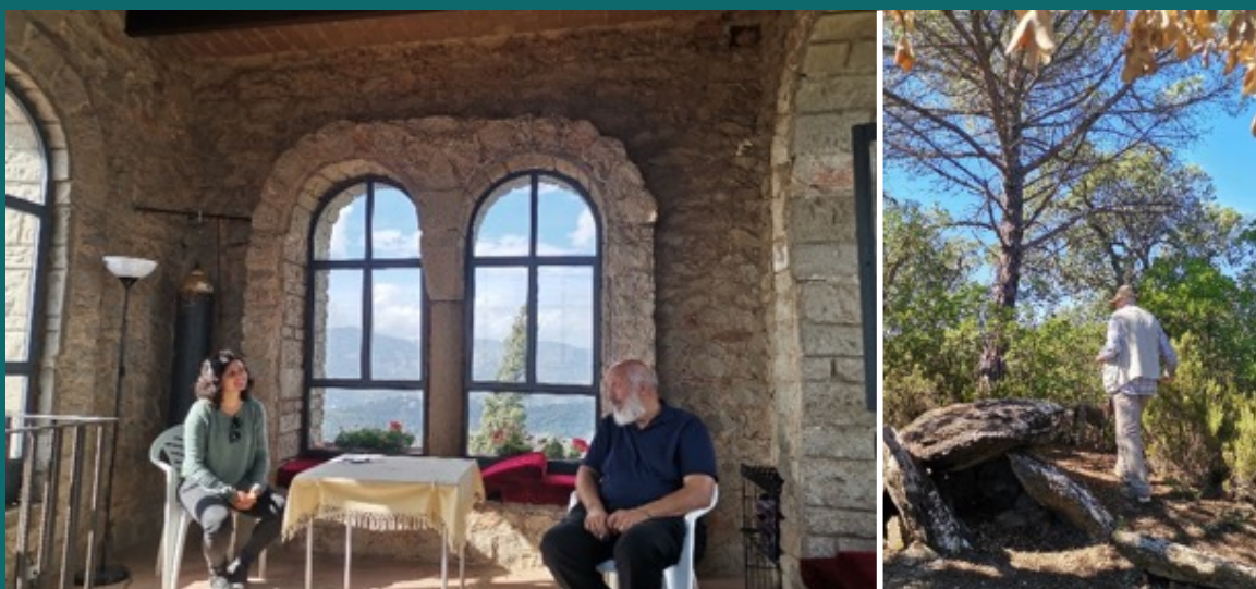
Figure 3. Dolmen (neolithic structure) documented at Finca Fitor.