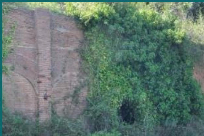
Figure 2. Remains of the brick factory located inside Les Ginesteres.